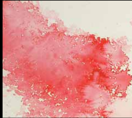
Spatter then sprayed