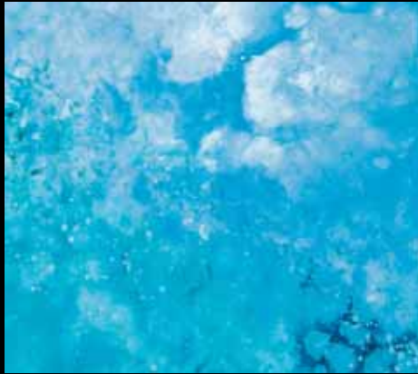
Watercolor with gesso added to blend