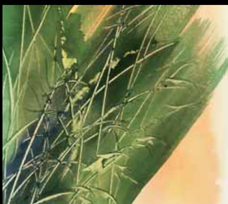
Scratching with pallette knife