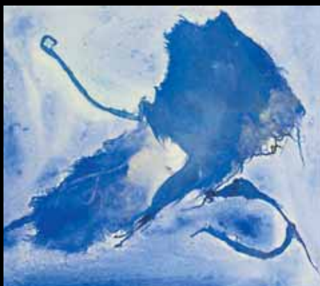
Rice paper glued on with polymer medium