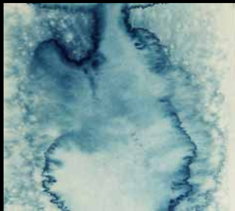
Sprayed water with anomizor