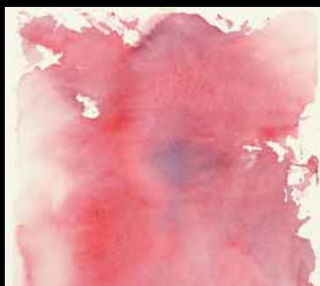
Dropping water on wet