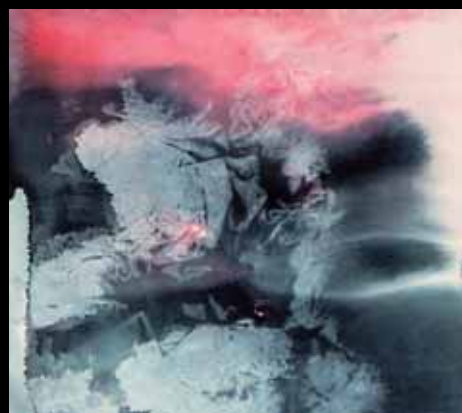
Lifting with tissue