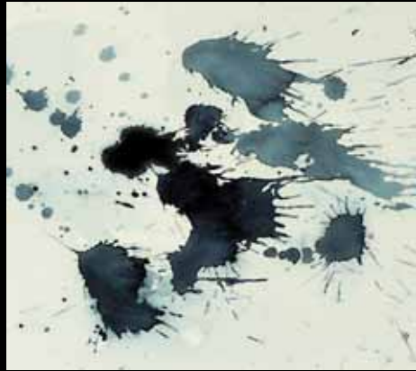
Hinging with brush