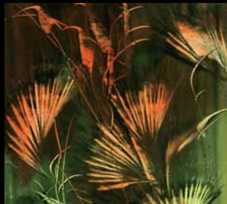
Under color glazes then applied darker color plus scratched top with pallette knife.