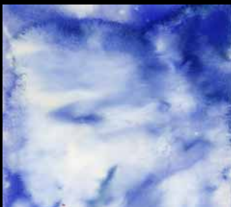
Wet on wet using white gouche