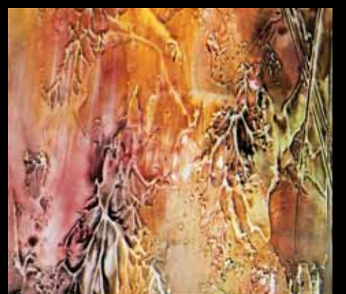
Modeling paste applied to dry board / used ink brayer to create texture