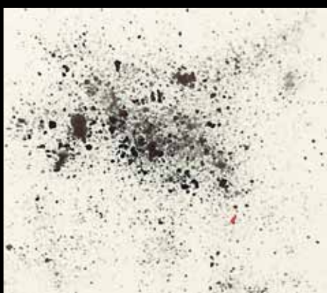
stipple with toothbrush