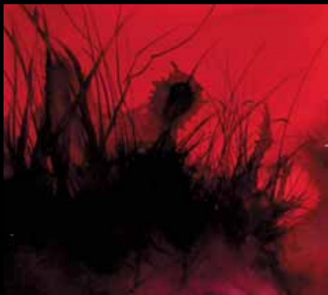
Wet into dry wash. Pulling grass up with riggor brush.