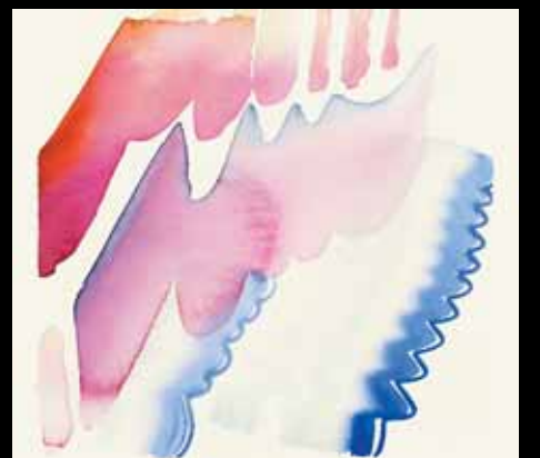
Color added on both sides of brush